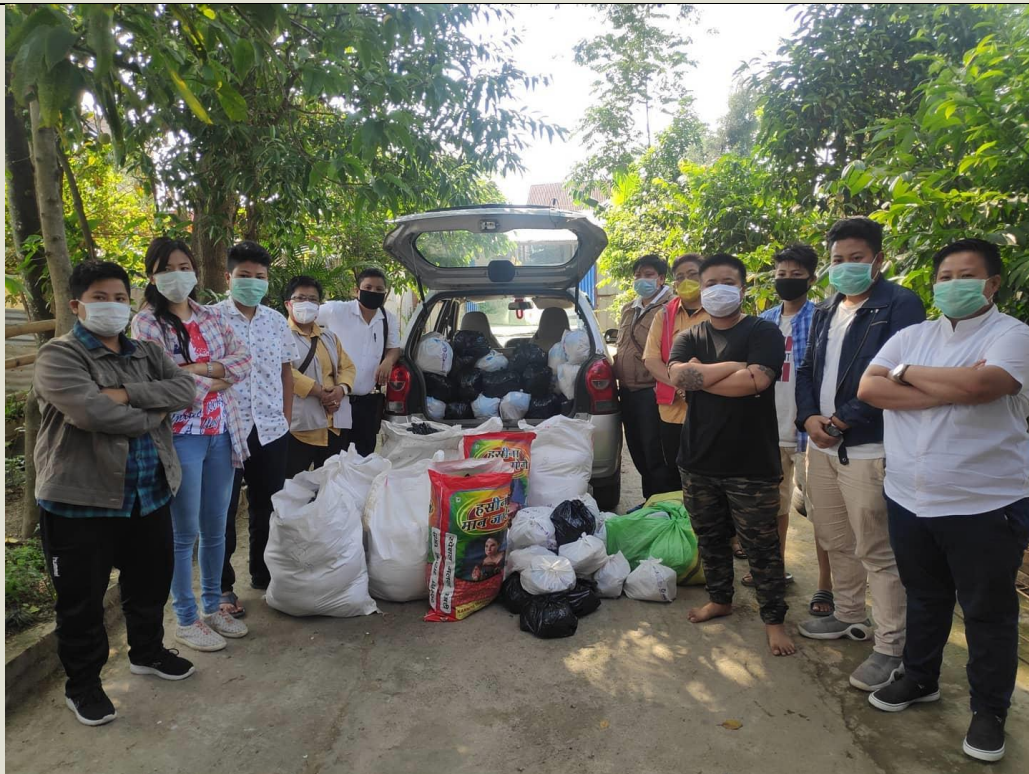
Distribution of Food material as part of Covid relief