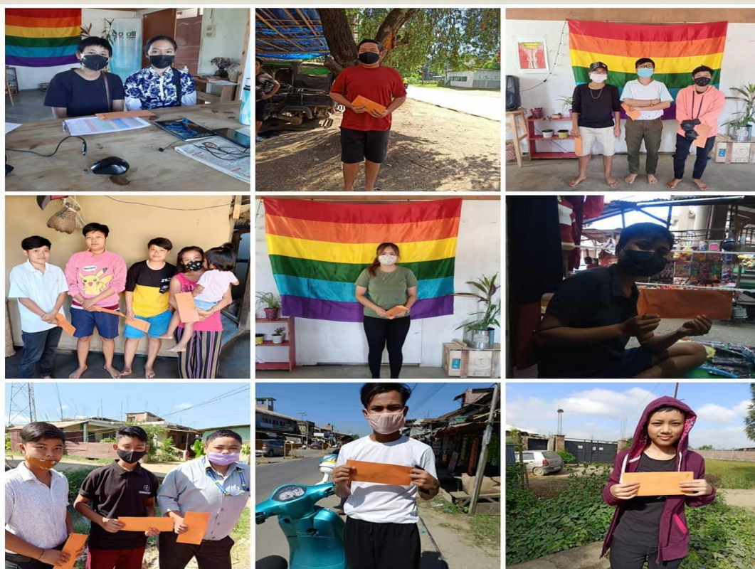
Support to the LGBTQIA community as part of COVID 19 Relief.