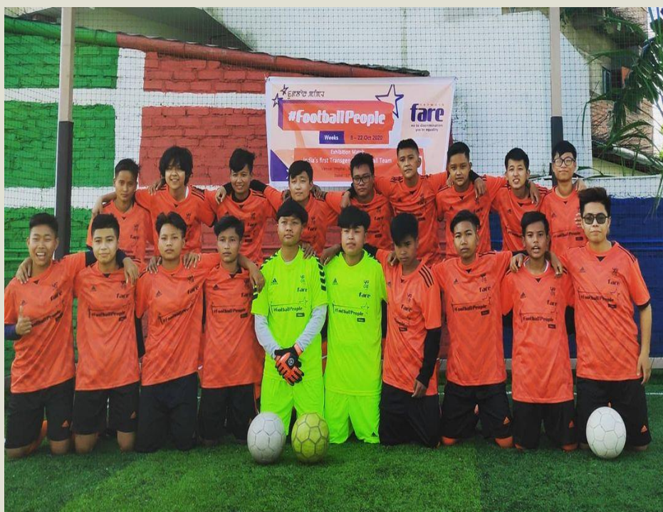
Exhibition Match of Ya_All Football Team