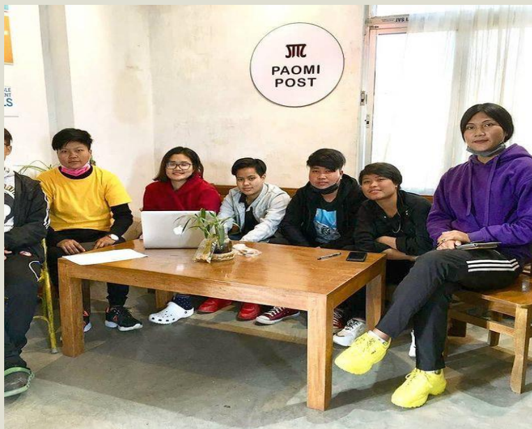
FGD with Key participants