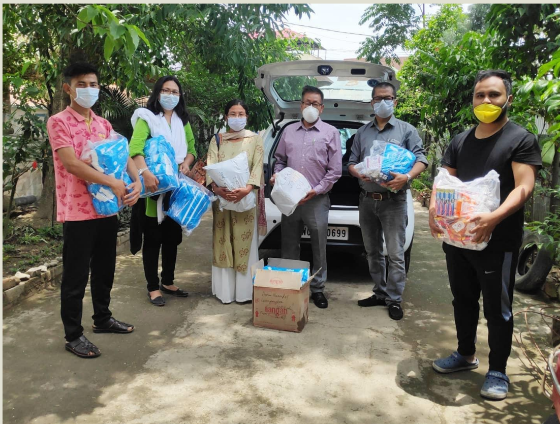
Distribution of Hygeine kit for children living with special health conditions