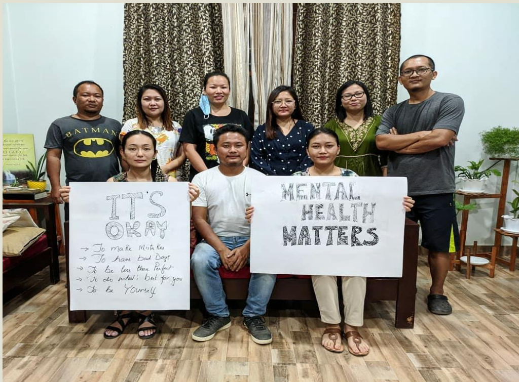
Community Mental Health Workshop with young adults at Langol.