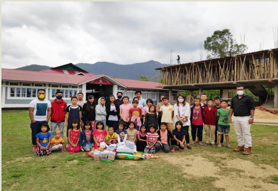
Distribution of ration as part of Khudol Initiative