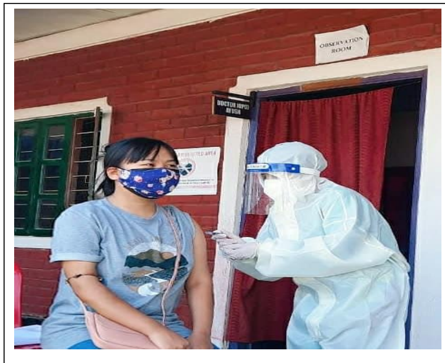
Vaccination drive of Young Key Population.