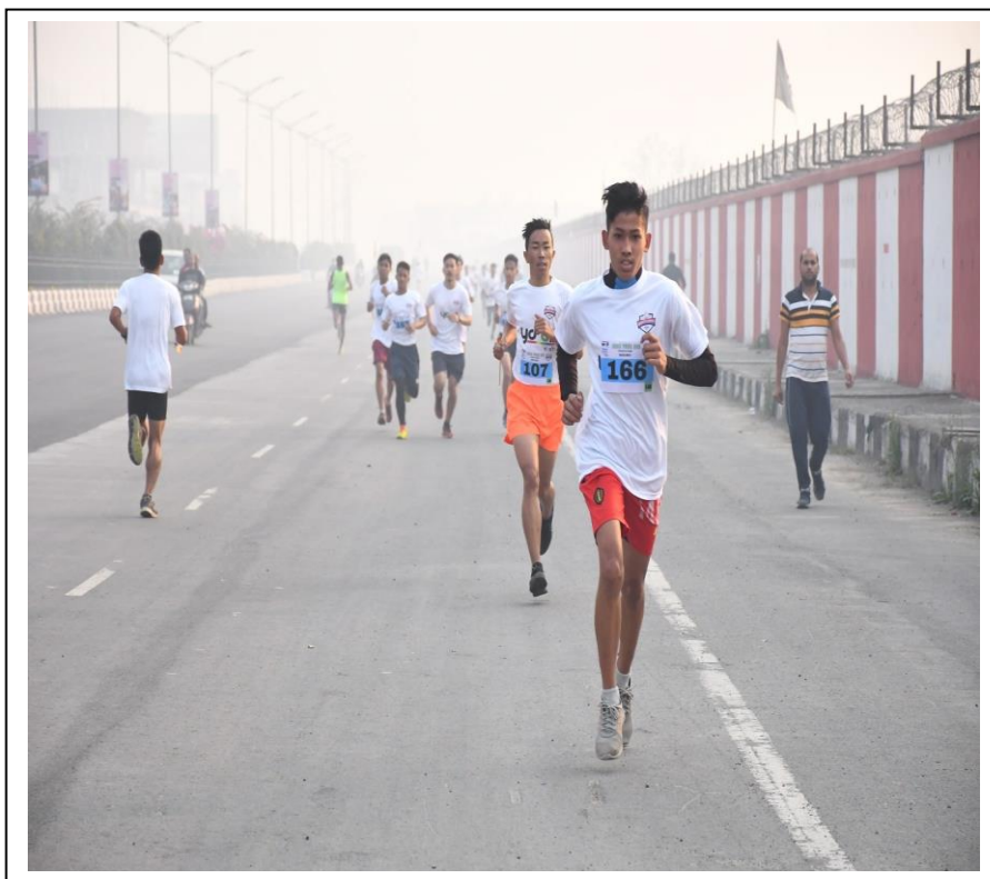
A glimpse from the 5 Km Marathon

The fifth edition of Queer Games was held in Imphal on 15 th and 16 th March 2022 with focus on breaking bias and advocating for inclusion of the LGBTQIA+ Community in sports. A two day event was organized which include Panel Discussion and India Pride Run. A total of 5 panel discussion was held on the 1 st day of the event virtually with renowned personalities working in the field of Sports, Mental Health, Entrepreneurship, LGBTIA Movement etc. as panellist. On the 2 nd day of the event a 5km and a 21 km Marathon was organized. A total of 300 individuals took part in the Marathon.