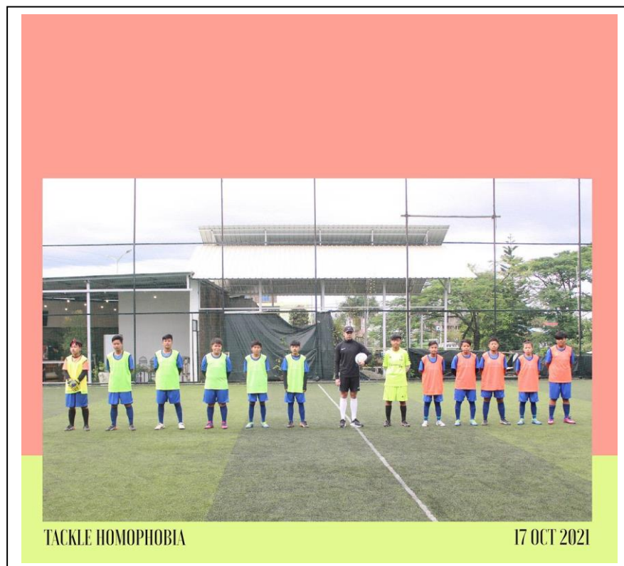
Exhibition Match of Ya_All Football Team