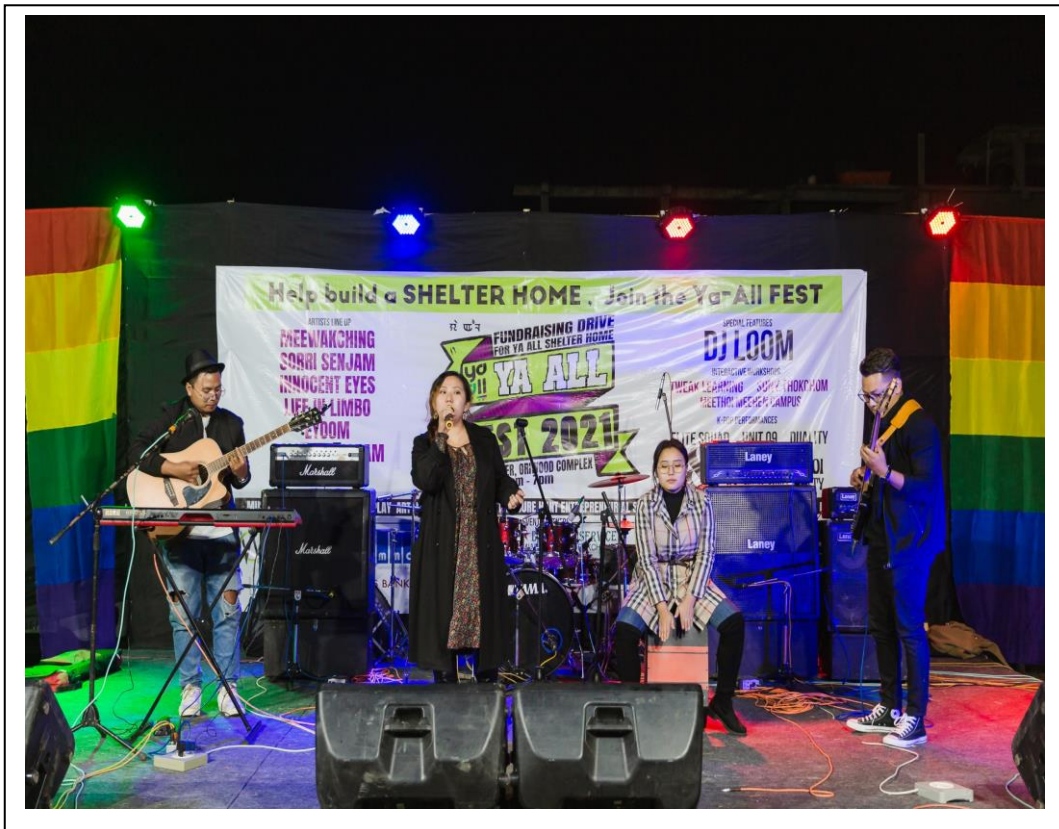
A glimpse from the Ya_All Fest