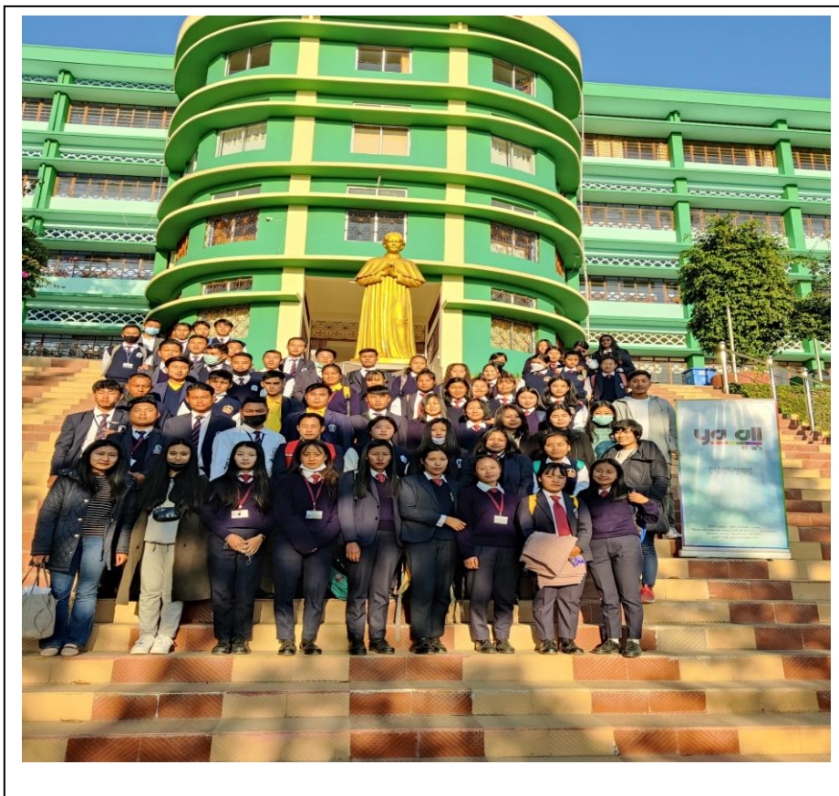
Mental Health Workshop with the MSW Students of Don Bosco College, Maram.