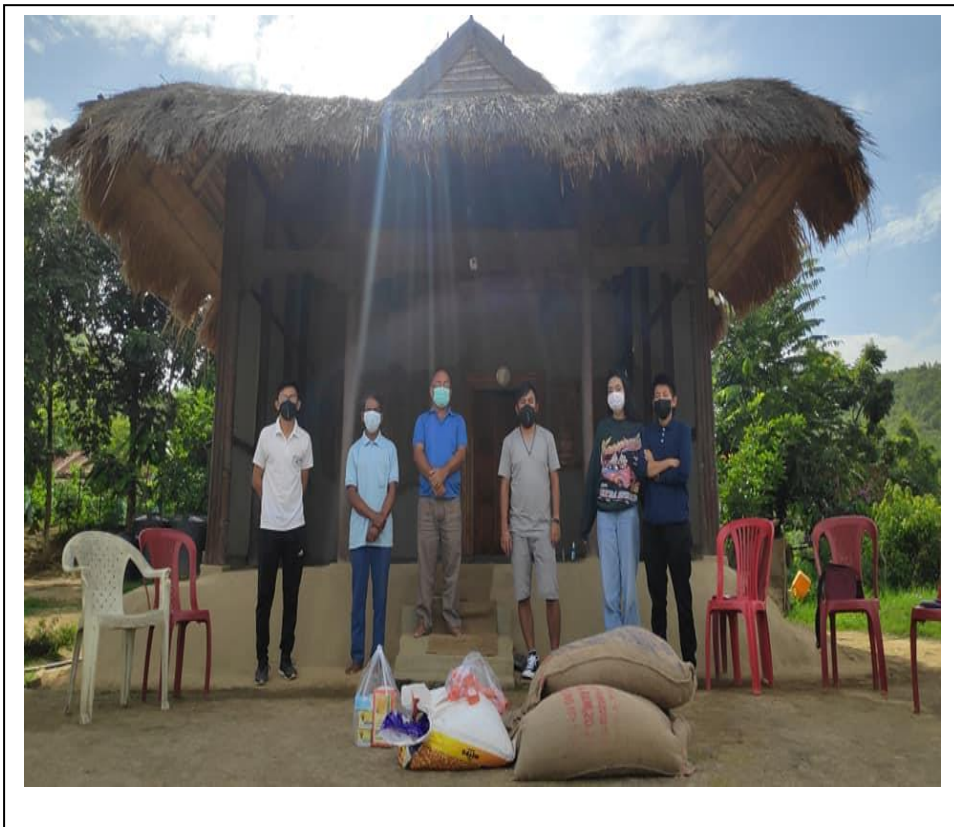
Distribution of ration as part of Khudol Initiative