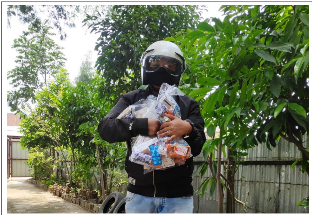
Distribution of Medical Kit for the LGBTQIA community as part of COVID 19 Relief