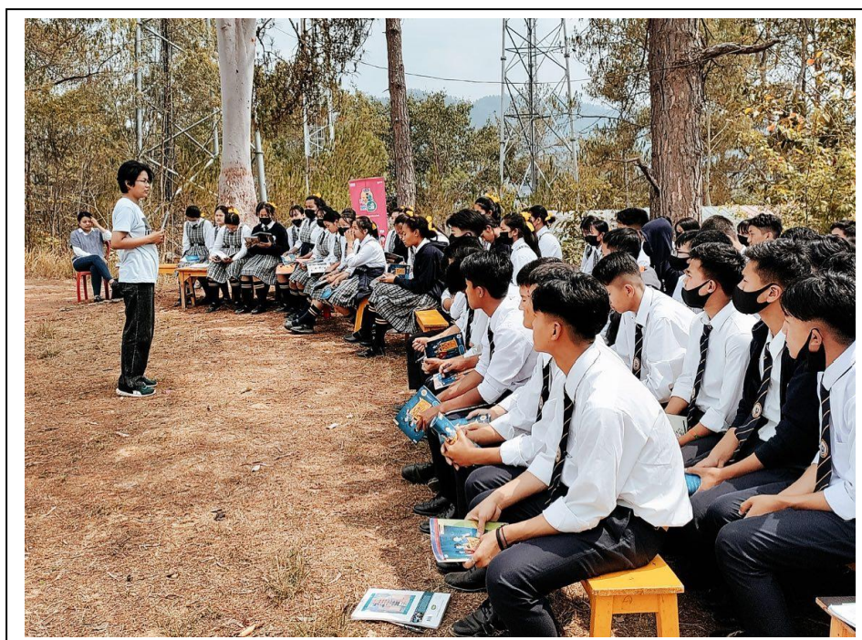
Session on Sexual and Reproductive Health Rights with the students of Oak Hill Christian Academy, Chandel.